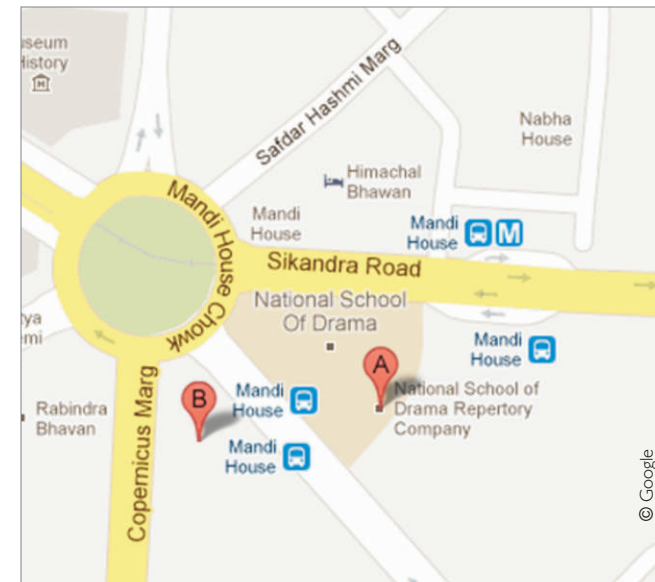
National School of Drama, Mandi House, New Delhi