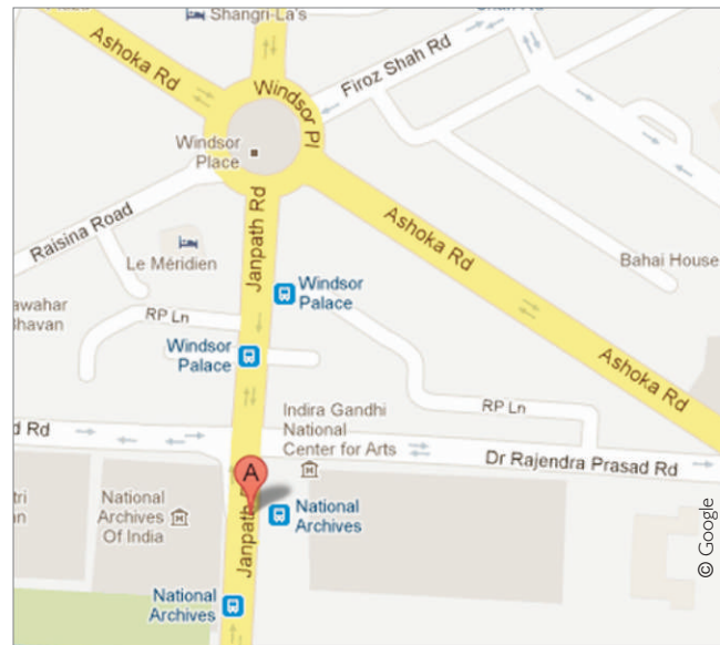
National Archives, Janpath, New Delhi